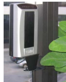
Optional window mount antenna

*Contact sales for availability in your region