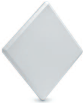
MP.11 Subscriber Unit with Integrated Antenna